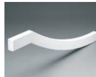
Slope Rail: Curve Transition