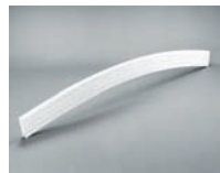
Inverted Scallop Rail