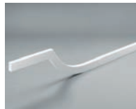
Slope Rail: 12-inch drop