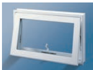
Series 3100 Casement