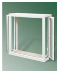
Series 2500 90° Bay