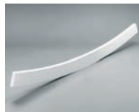
Scallop Rail: 6-inch drop