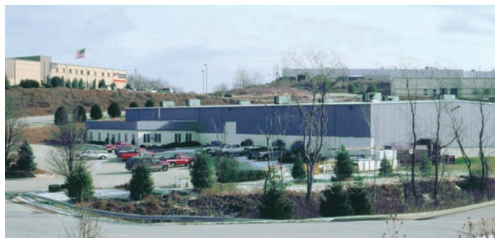
Ventana USA operates two manufacturing facilities, Ventana I and Ventana II, in Export PA (twenty-five miles east of Pittsburgh).