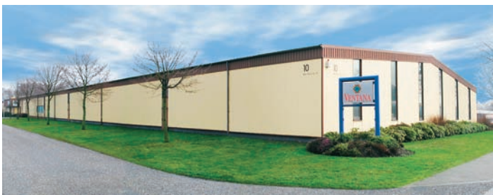
Ventana Deutschland (Vreden, Germany)

Our sister companies Ventana Deutschland and Ventana France serve the window and fence markets in Europe.