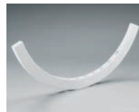
Scallop Rail: 16-inch drop