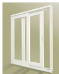
Series 4000 Sliding Door