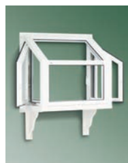
Series 2051 Stucco Replacement Garden Window