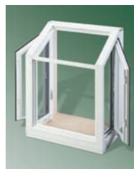
Series 2050 Garden Window