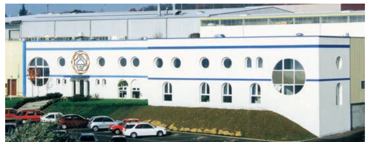
Ventana France (Faulquemont, France)