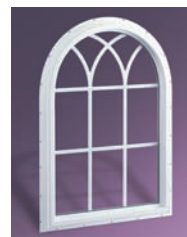
Specialty Grid Systems