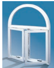
Architectural Combination Casement