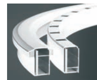
Reinforced Curved Deck Railing