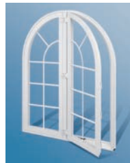
Series 3000 Architectural Casement