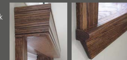
Valance and bullnose edging detail